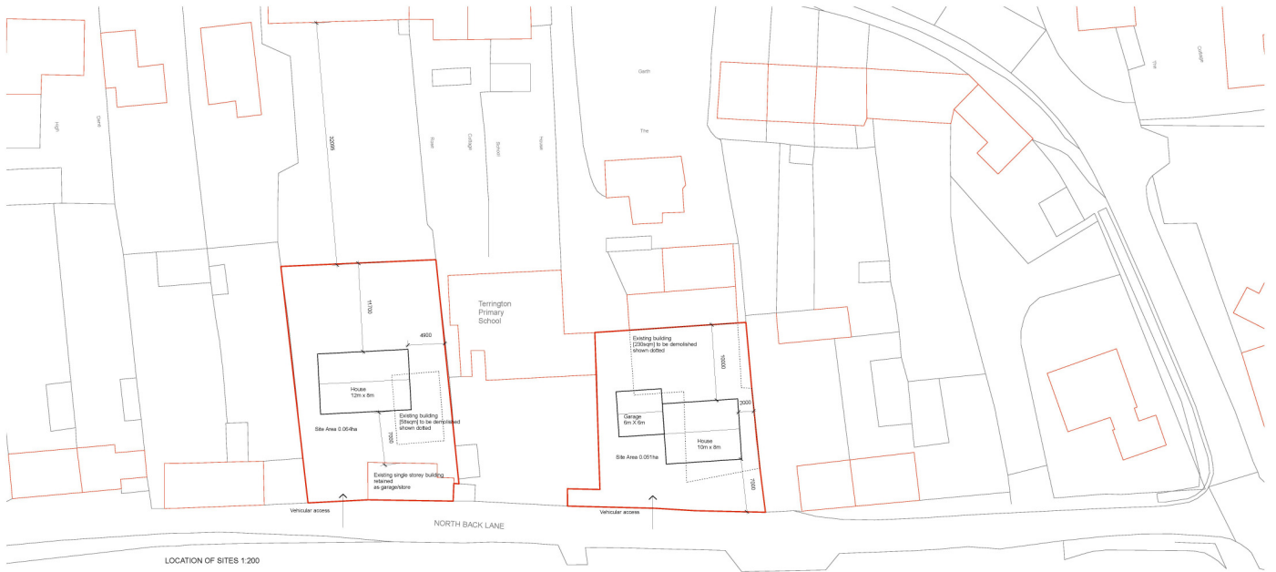
LOCATION OF SITES 1.200